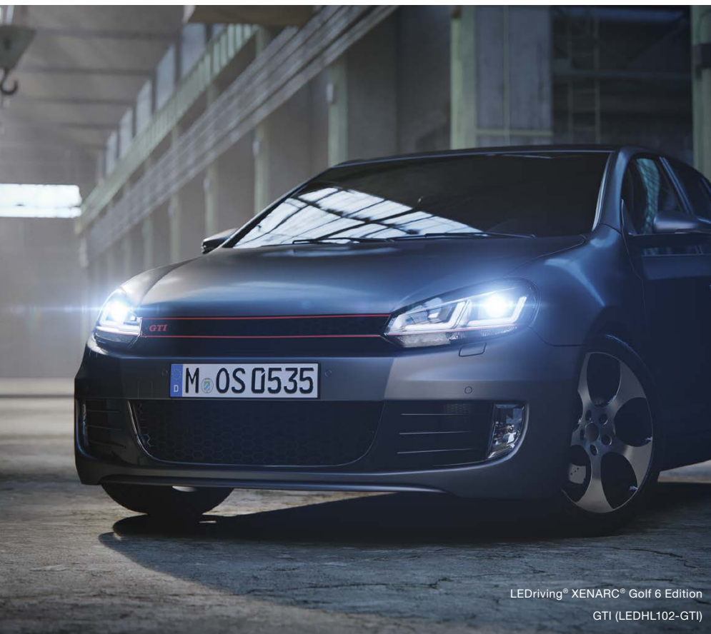
LEDDriving® XENARC® Golf 6 Edition GTI (LEDHL102-GTI)

With its outstanding design, the LEDDriving® XENARC® headlight combines modern LED daytime running light functionality with a powerful xenon lamp. With this halogen retrofit, OSRAM offers a solution for all Golf 6 models not shipped with xenon headlights. Upgrading to the ECE-approved LEDDriving® XENARC® headlight complies with all legal requirements – no need to fit automatic leveling or a headlight-cleaning system.